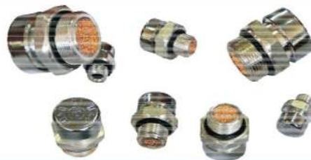
Breather Plugs / Aluminum