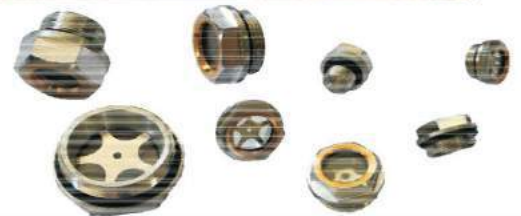
Oil Level Sight / Aluminum