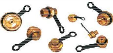
Vent Plugs / Brass