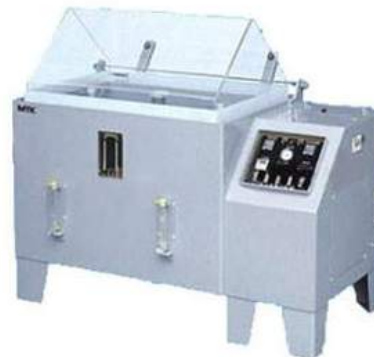
Salt Spray Machine