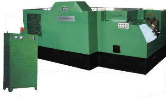
Cold Forging Machine